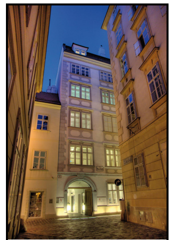
Mozarthus Vienna