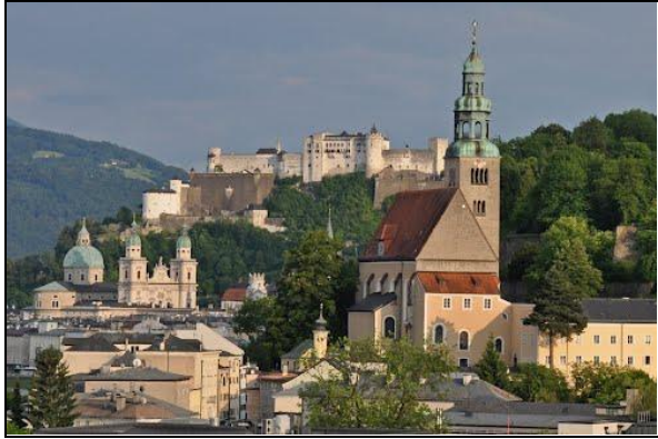
Müllner Kirche, Salzburg