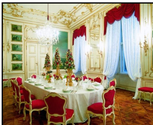
Schönbrunn Palace