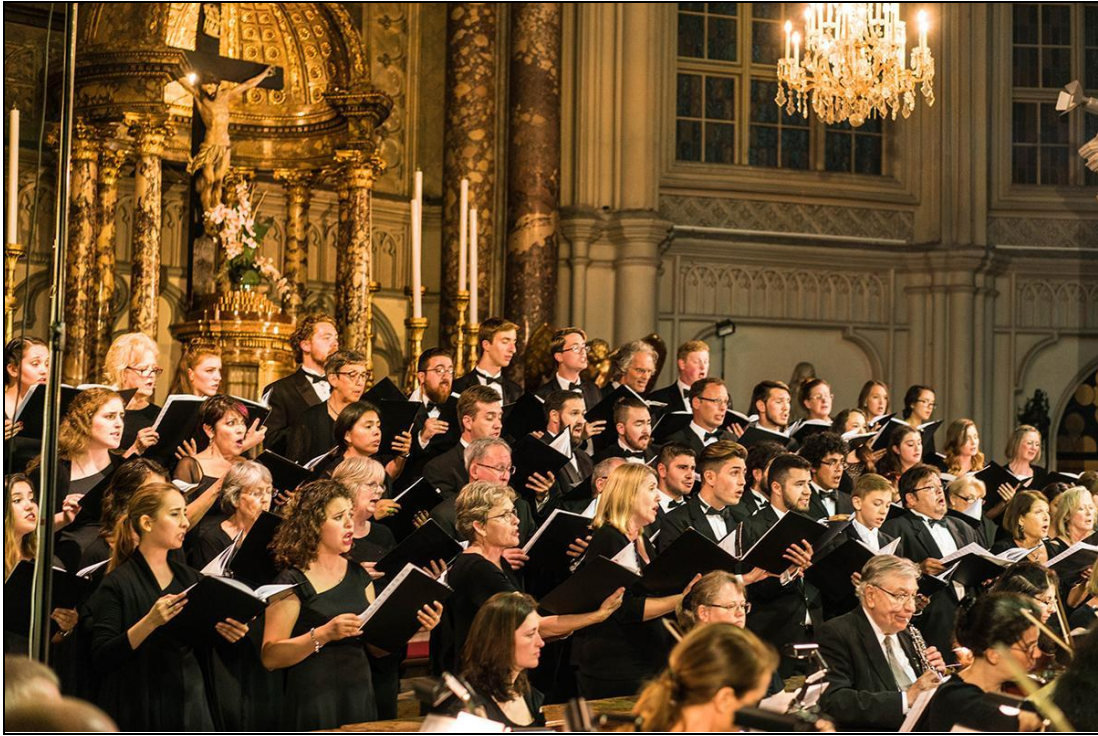
American choral artists perform at Minoritenkirche, Vienna