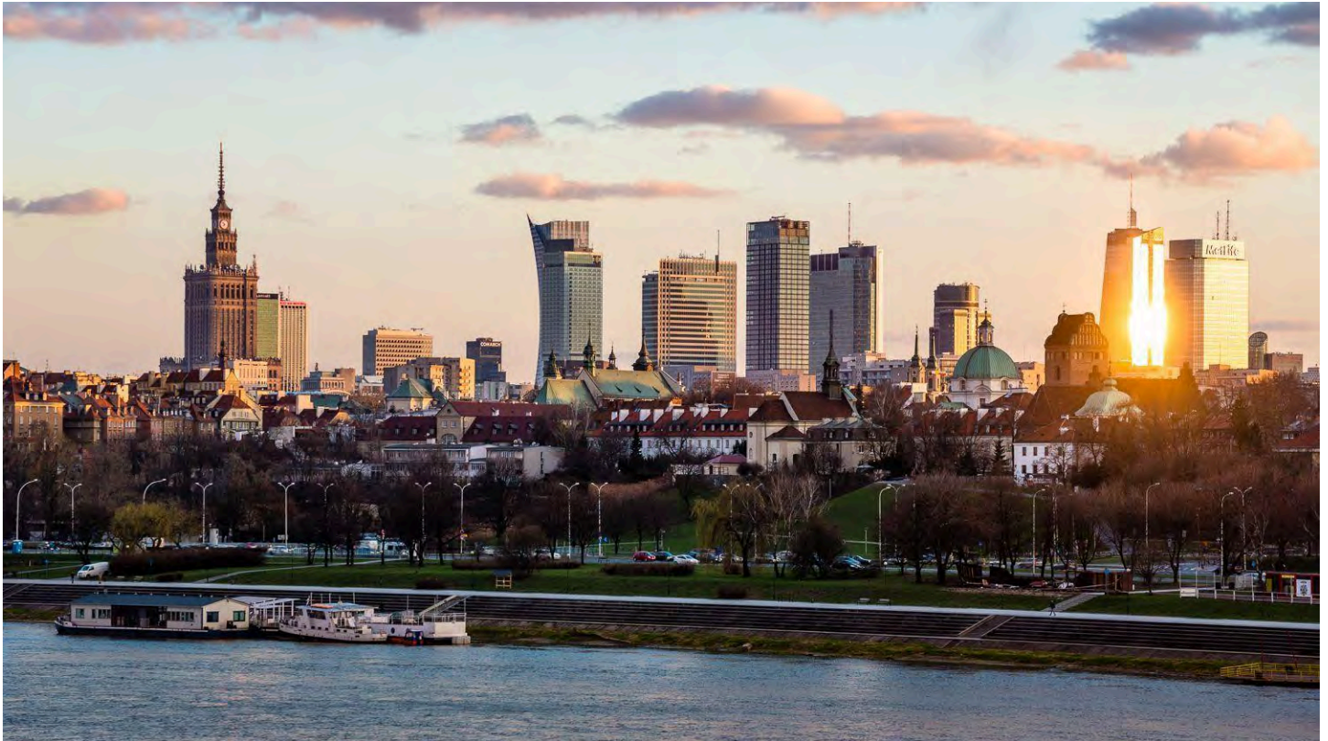
Warsaw and Vistula River