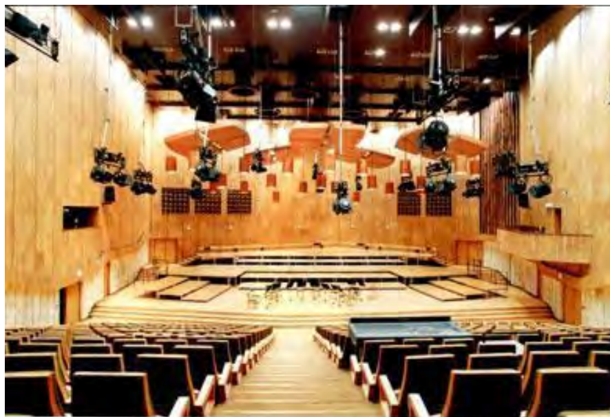
Witold Lutosławski Concert Studio Of Polish Radio, Warsaw