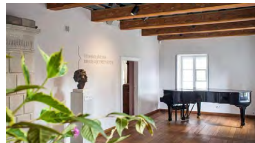
Żelazowa Wola: Birthplace of Chopin