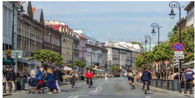
Royal Route – Krakowskie Przedmieście Street