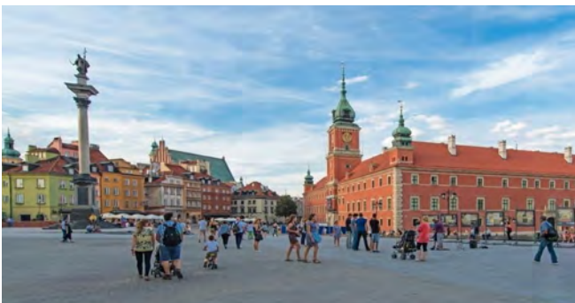
Royal Route – St. Anna's Church

First Tour: General Warsaw Tour Panoramic city-sightseeing includes the most interesting and important tourist attractions of the city: The Royal Route with superb aristocratic residences, churches and famous monuments, Presidential Palace, statue of Copernicus, Holy Cross Church (interment site of the heart of Fryderyk Chopin), Warsaw University, Old Town (UNESCO World Heritage Site with Royal Castle), St. John's Cathedral Market Square, Barbican, New Town with monument of the Warsaw Uprising of 1944, former Jewish Ghetto area with Memorial to the Heroes of the Ghetto Uprising, and the Tomb of the Unknown Soldier plus the Praga District, and BUW Botanic Gardens, https://warsawtour.pl/en/warsaw-old-town-guided-walk/ and https://warsawtour.pl/en/the-praga-district/