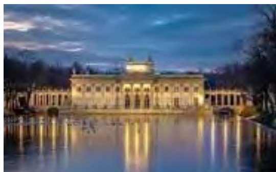
Łazienki Królewskie Park and Museum

Fourth Tour: Łazienki Królewskie: This park is the largest in Warsaw, Poland. It lies in the city center which is part of the Royal Route that links the Royal Castle with Wilanów Palace to the south. The Royal Łazienki was the residence of King Stanislaw. It features unique architecture, monuments and beautiful gardens.